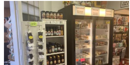
Figure 1. A grab-and-go cooler by the entrance at Jackson Meats provides easy access to fresh and healthy options, thanks to a Pathways grant.

Heal Action: We are proud of the five locally-owned restaurants and two retailers who made healthy changes to their menus or environments to make it easier for residents to choose and eat nutritious food. To increase access to healthy foods during the COVID-19 crisis, we are helping to distribute produce boxes to vulnerable populations in Reno County ( Figure 1 ).